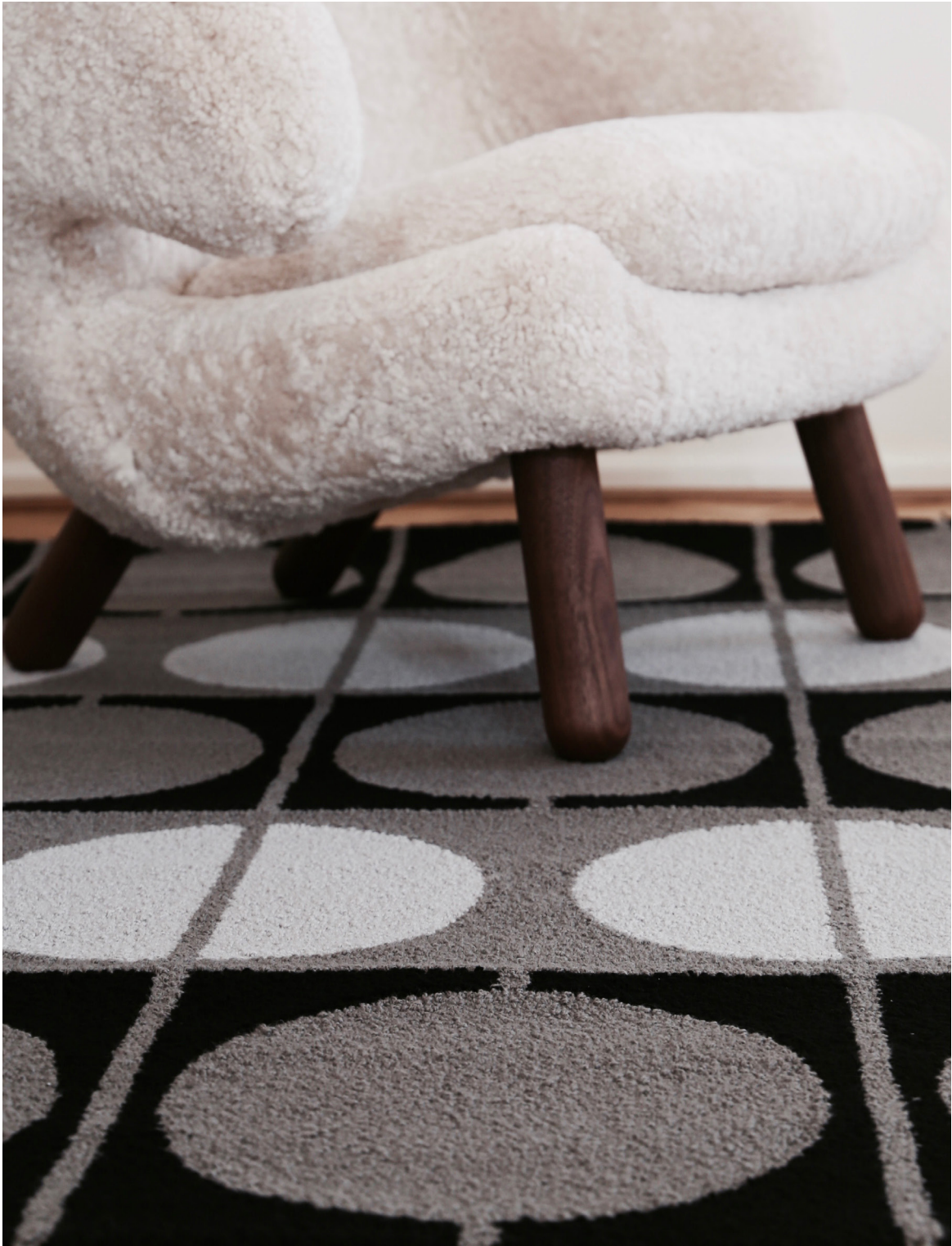
CIRCLE RUG 1963 BY FINN JUHL